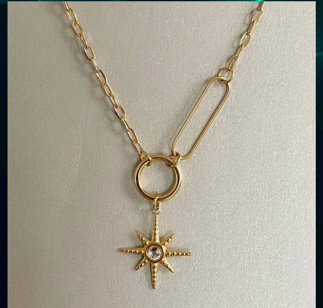
Sahara Luxe 18k Plated Double Layer Necklace