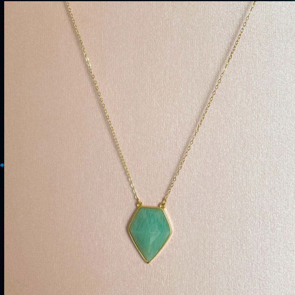
Athena Luxe Faceted Amazonite Necklace