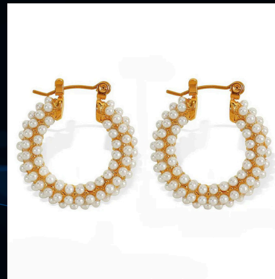
Siren Luxe 18k Gold Plated Pearl Studded Hoop Earrings