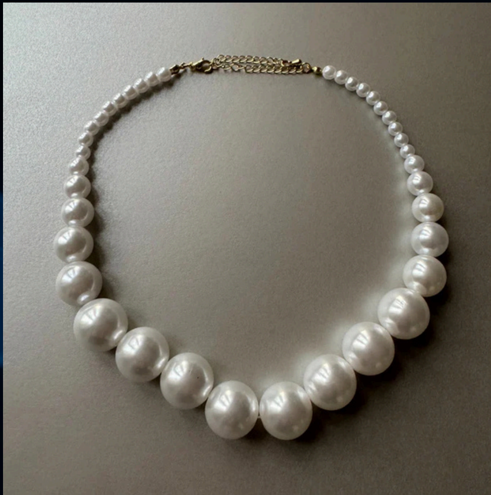
Jura Graduated Statement Pearl Necklace