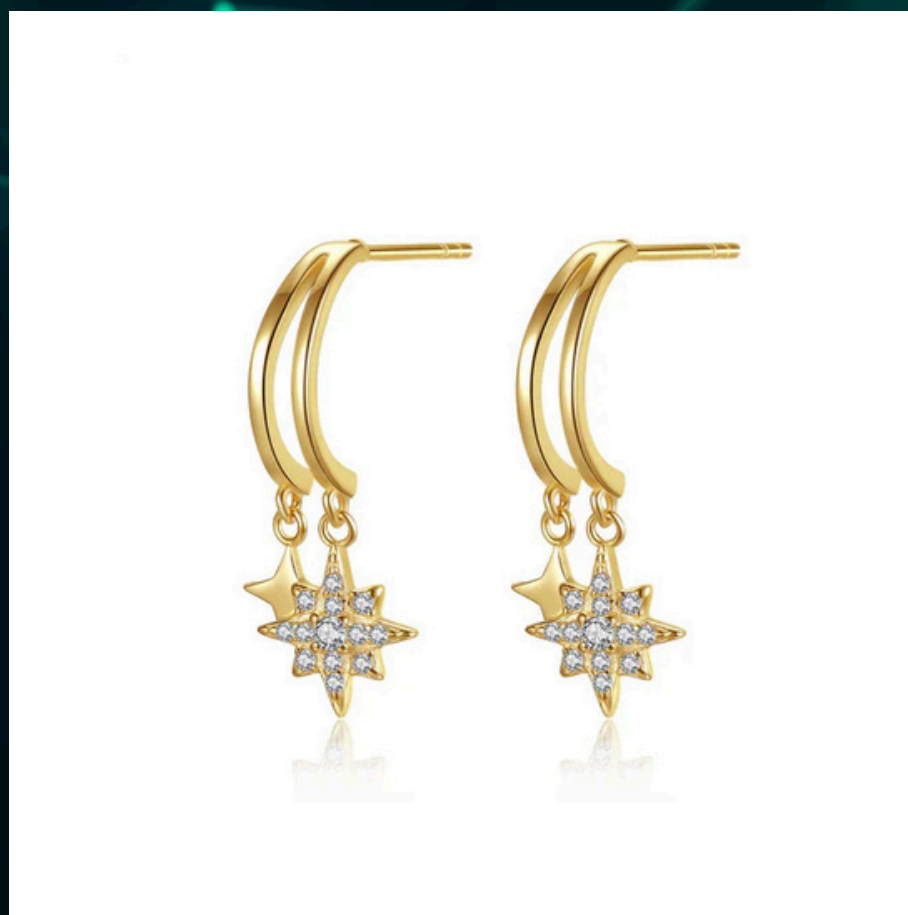
Trinity Luxe Mini Sterling Silver Double Hoop Earrings With Star Charms