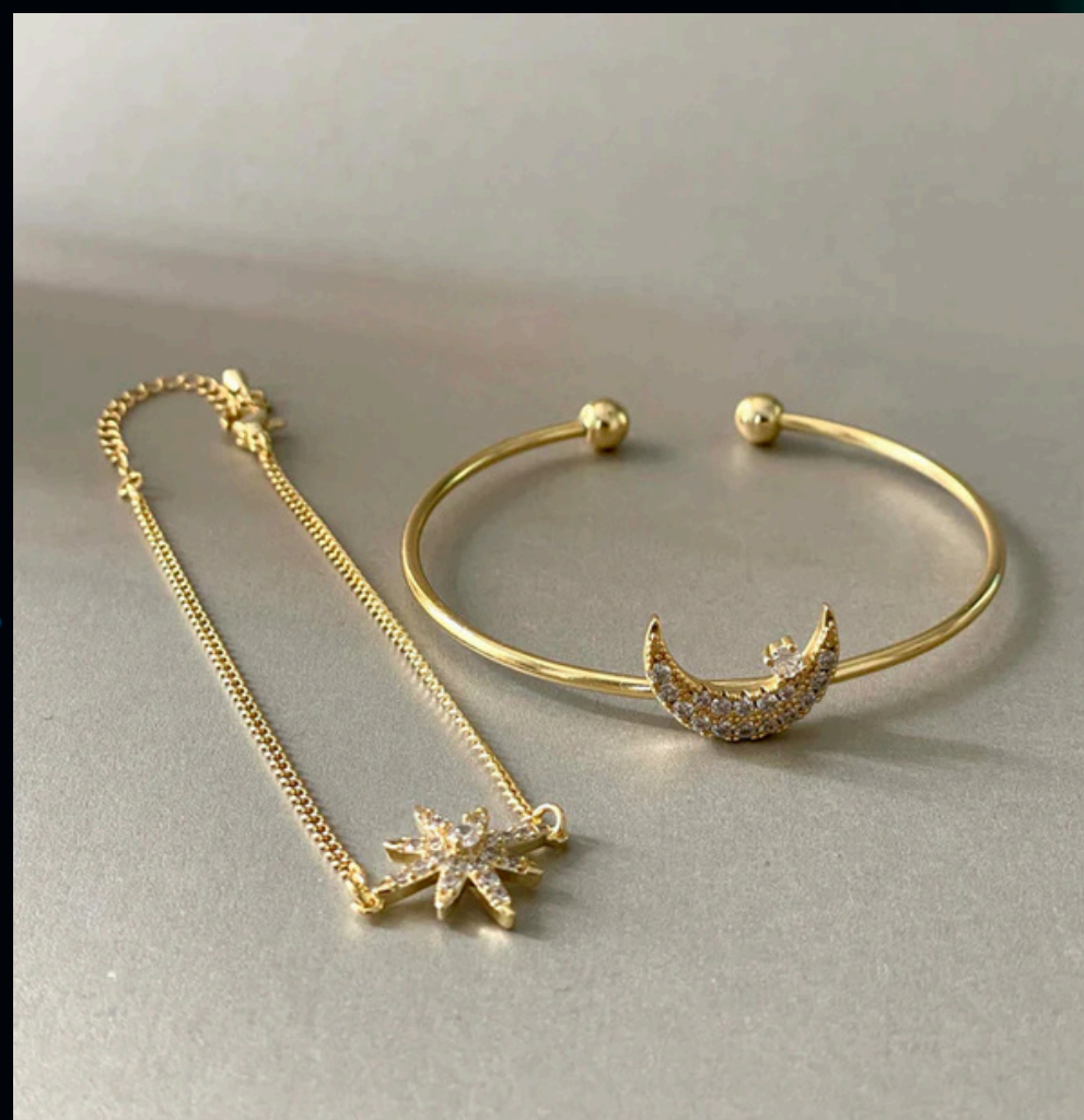
Laila Luxe 18k Gold Plated Celestial Bracelet Set