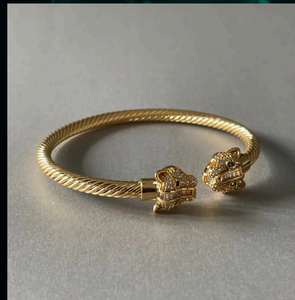
Zuri Gold Textured Panther Cuff