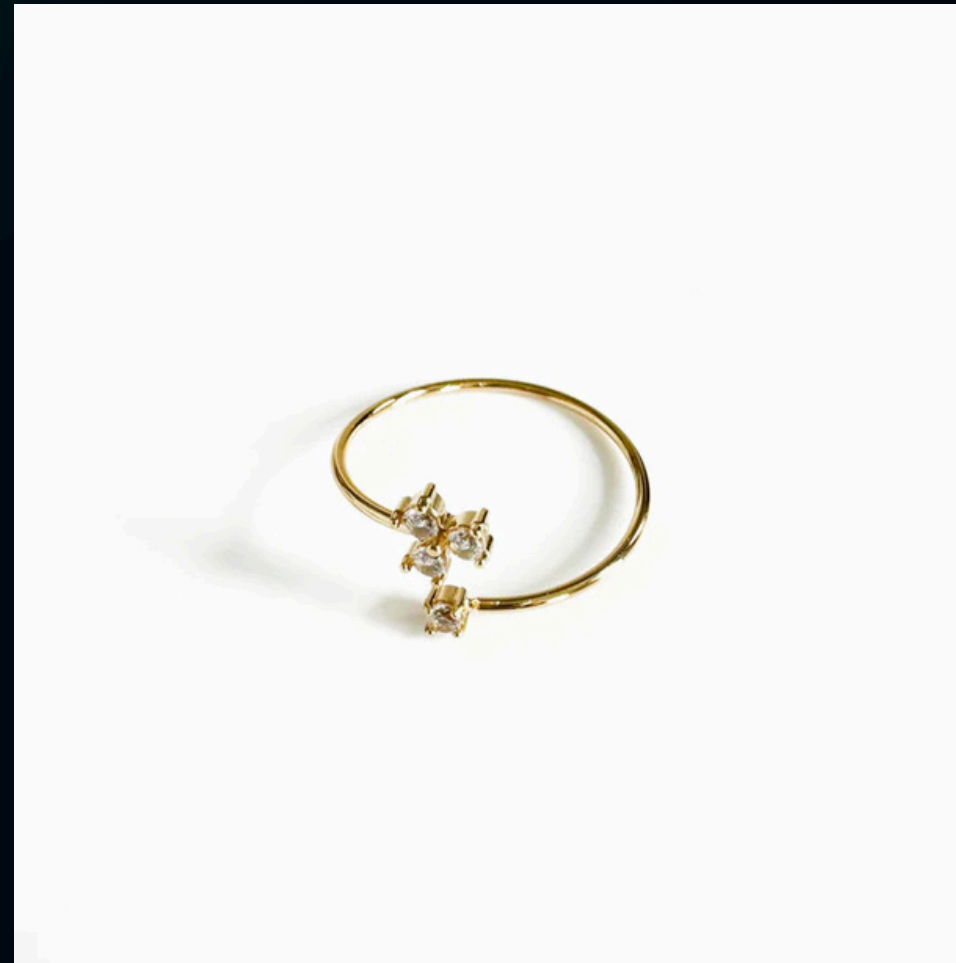
Liberty Luxe 18k Gold Plated Jewelled Wrap Ring