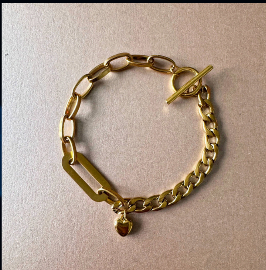
Danni Luxe 18k Gold T Bar Charm Bracelet