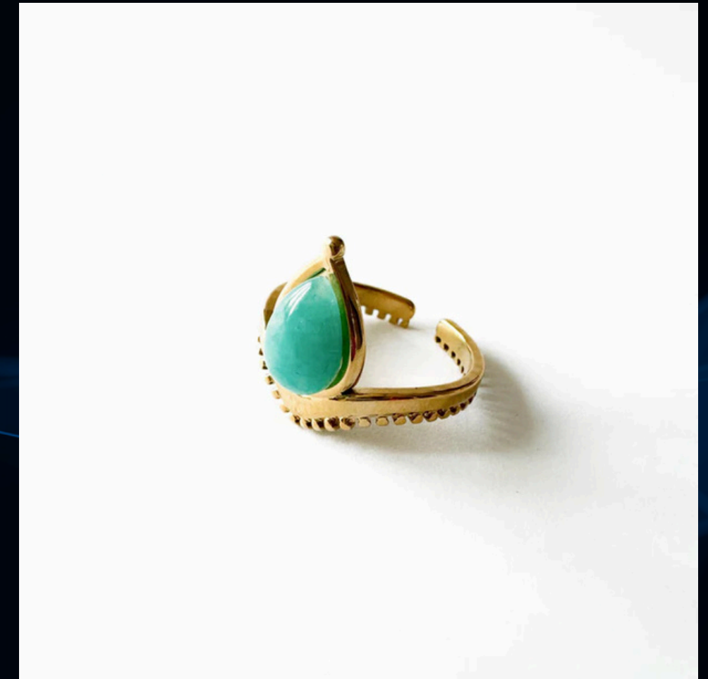
Emmy Luxe 18k Gold Plated Turquoise Stone Ring